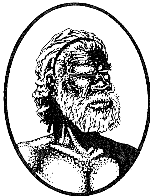
BLACKTOWN LEAGUES CLUB